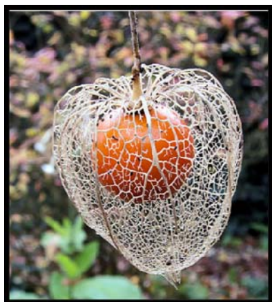
Figure: Kaknaj (Fruits of Physalis alkekengi ).